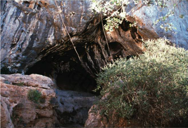
▲ FIGURE 12-31 EARLY SETTLEMENT Karain Cave, Turkey. Evidence of human settlement has been found in the cave dating back 150,000–200,000 years.

No one knows the precise sequence of events through which settlements were established to provide services. Based on archaeological research, settlements probably originated to provide consumer and public services. Business services came later.