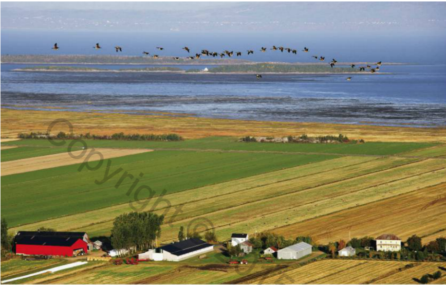
▲ FIGURE 12-28 CLUSTERED LINEAR RURAL SETTLEMENT Québec long lots.

to the river, so that each original settler had river access. This created a linear settlement along the river. These long, narrow lots were eventually subdivided. French law required that each son inherit an equal portion of an estate, so the heirs established separate farms in each division. Roads were constructed inland parallel to the river for access to inland farms. In this way, a new linear settlement emerged along each road, parallel to the original riverfront settlement.