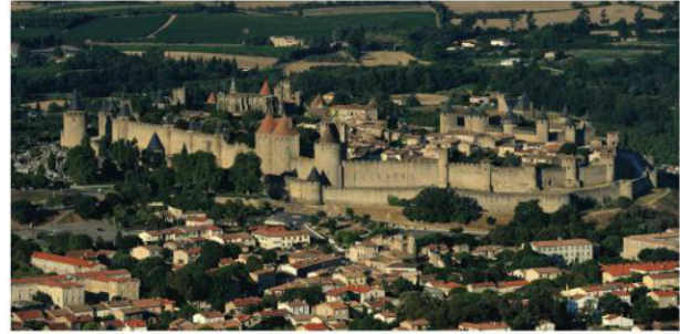
▲ FIGURE 12-35 MEDIEVAL URBAN SETTLEMENT: CARCASSONNE Medieval European cities, such as Carcassonne in southwestern France, were often surrounded by walls for protection. The walls have been demolished in most places, but they still stand around the medieval center of Carcassonne.

lords established new urban settlements. The lords gave residents charters of rights with which to establish independent cities in exchange for their military service. Both the lord and the urban residents benefited from this arrangement. The lord obtained people to defend his territory at less cost than maintaining a standing army. For their part, urban residents preferred periodic military service to the burden faced by rural serfs, who farmed the lord's land and could keep only a small portion of their own agricultural output.