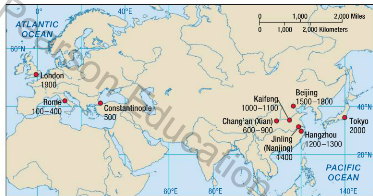
▲ FIGURE 12-36 LARGEST SETTLEMENTS SINCE 1 A.D. The largest cities have been in China for most of the past 2,000 years.

The largest medieval European urban settlements served as power centers for the lords and church leaders, as well as major market centers. The most important public services occupied palaces, churches, and other prominent buildings arranged around a central market square. The tallest and most elaborate structures were usually churches, many of which still dominate the landscape of smaller European towns. In medieval times, European urban settlements were usually surrounded by walls even though by then cannonballs could destroy them (Figure 12-35). Dense and compact within the walls, medieval urban settlements lacked space for construction, so ordinary shops and houses nestled into the side of the walls and the large buildings. Most of these modest medieval shops and homes, as well as the walls, have been demolished in modern times, with only the