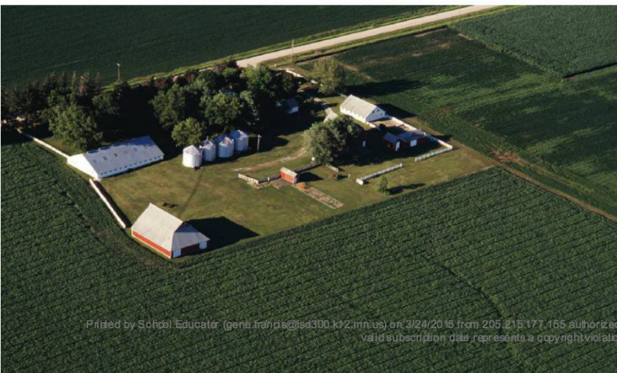
▼ FIGURE 12-30 DISPERSED RURAL SETTLEMENT Wisconsin.

Printed by School Educator (gene.francis@isd300.k12.mn.us) on 3/24/2015 from 205.215.177.155 authorized to use until 3/20/2016. Use beyond the authorized user or valid subscription date represents a copyright violation.