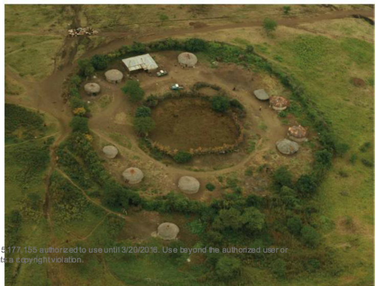
▼ FIGURE 12-27 CIRCULAR RURAL SETTLEMENT A kraal village, Kenya.

In the French long-lot system, houses were erected along a river, which was the principal water source and means of communication. Narrow lots from 5 to 100 kilometers (3 to 60 miles) deep were established perpendicular