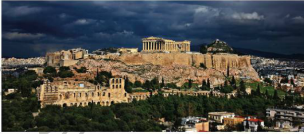
▲ FIGURE 12-34 ANCIENT URBAN SETTLEMENT: ATHENS Dominating the skyline of modern Athens is the ancient hilltop site of the city, the Acropolis. Ancient Greeks selected this high place because it was defensible, and they chose it as a place to erect shrines to their gods. The most prominent structure on the Acropolis is the Parthenon, built in the fifth century B.C. to honor the goddess Athena. The structure in the foreground is the Herodes Atticus Odeon, a theater built in 161 A.D. Behind the Odeon is the Propylaea, which was the entrance gate to the Acropolis. To the right of the Parthenon, in the background, is the Chapel of St. George, built in the nineteenth century atop Mount Lycabettus, the highest point in Athens.