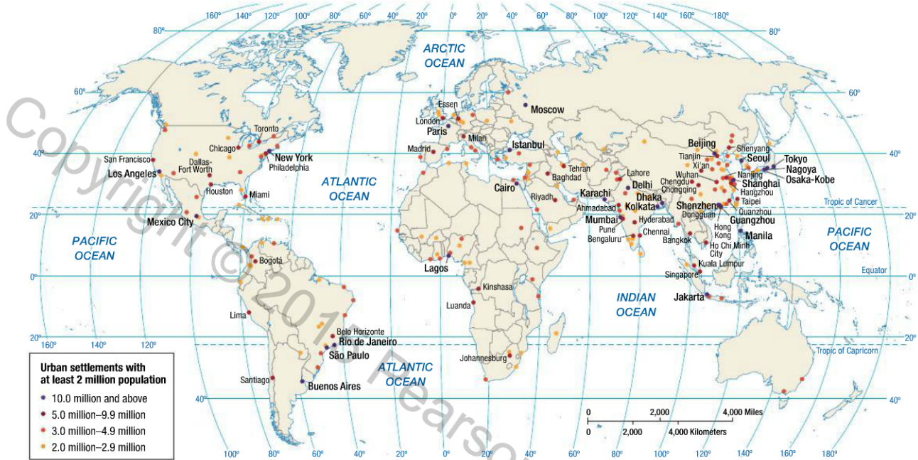
▲ FIGURE 12-38 URBAN SETTLEMENTS WITH AT LEAST 2 MILLION INHABITANTS

Most of the world's largest urban settlements are in developing countries, especially in East Asia, South Asia, and Latin America.