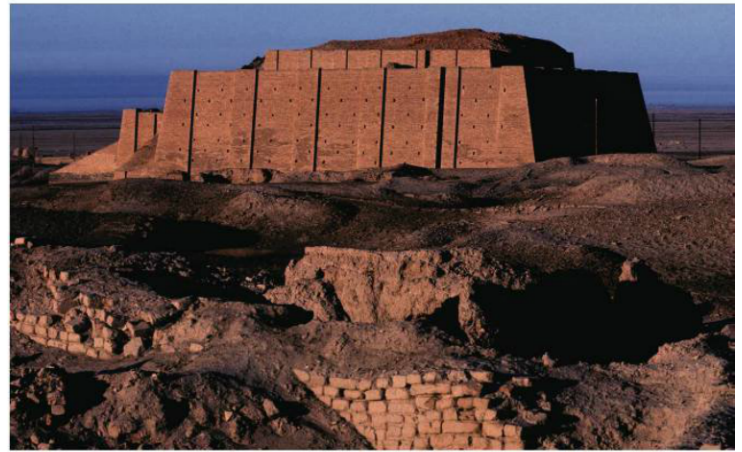
▲ FIGURE 12-33 PREHISTORIC URBAN SETTLEMENT: UR The remains of Ur, in present-day Iraq, provide evidence of early urban civilization. Ancient Ur was compact, perhaps covering 100 hectares (250 acres), and was surrounded by a wall. The most prominent building, the stepped temple, called a ziggurat , was originally constructed around 4,000 years ago. The ziggurat was originally a three-story structure with a base that was 64 by 46 meters (210 by 150 feet) and the upper stories stepped back. Four more stories were added in the sixth century B.C. Surrounding the ziggurat was a dense network of small residences built around courtyards and opening onto narrow passageways. The excavation site was damaged during the two wars in Iraq.

Athens, the largest city-state in ancient Greece (Figure 12-34), made substantial contributions to the development of culture, philosophy, and other elements of Western civilization, an example of the traditional distinction between urban settlements and rural. The urban settlements provided not only public services but also a concentration of consumer services, notably cultural activities, not found in smaller settlements.