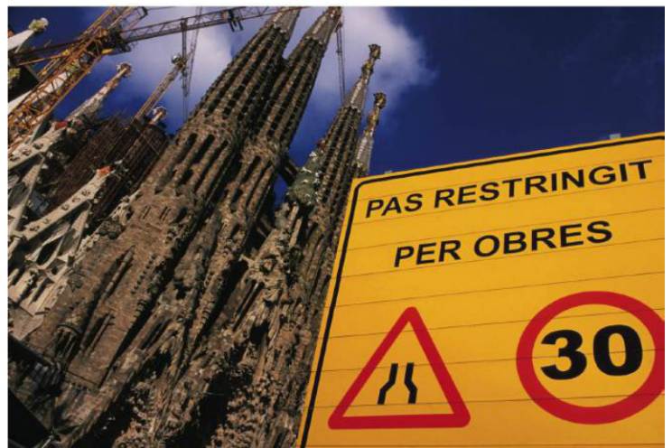
▲ FIGURE 5-14 CATALÁN The sign says "Passage is restricted to workers." The sign is in front of Sagrada Família church, designed by Antoni Gaudi, in Barcelona, Spain.

A Romance tongue called Ladino—a mixture of Spanish, Greek, Turkish, and Hebrew—is spoken by 100,000 Sephardic Jews, most of whom now live in Israel. None of these languages have an official status in any country, although they are used in literature.