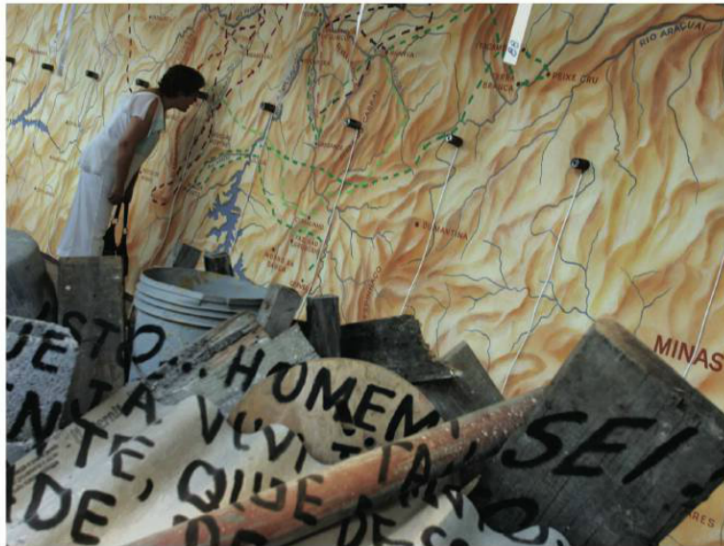
▼ FIGURE 5-17 A ROMANCE LANGUAGE: PORTUGUESE The Museum of Portuguese Language in São Paulo, Brazil, has exhibits related to the Portuguese language, such as authors who have written in Portuguese.

Printed by School Educator (gene.francis@isd300.k12.mn.us) on 2/4/2015 from 205.215.177.155 authorized to use until 3/20/2016. Use beyond the authorized user of valid subscription date represents a copyright violation.