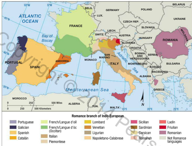
▲ FIGURE 5-13 ROMANCE BRANCH OF THE INDO-EUROPEAN LANGUAGE FAMILY Romance branch languages predominate in southwestern Europe.