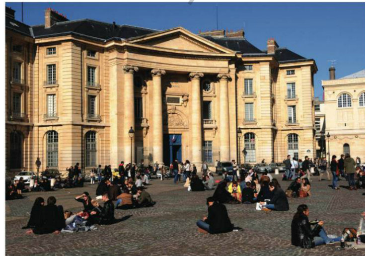
▲ FIGURE 5-16 PARIS LATIN QUARTER The university area of Paris gets its name from the Latin language, which was the language of instruction when the universities were founded during the Middle Ages.

In the past, when migrants were unable to communicate with speakers of the same language back home, major differences emerged between the languages spoken in the old and new locations, leading to the emergence of distinct, separate languages. This was the case with the migration of Latin speakers 2,000 years ago.