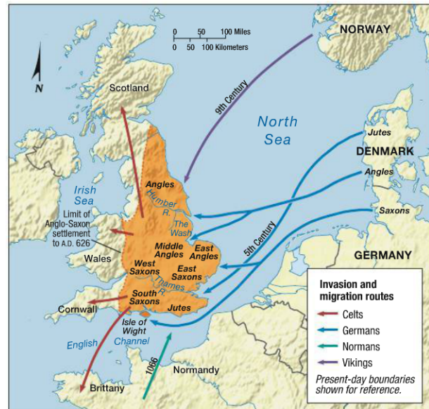
FIGURE 5-15 INVASIONS OF ENGLAND The first speakers of the language that became known as English were tribes that lived in present-day Germany and Denmark. They invaded England in the fifth century. The Jutes settled primarily in southeastern England, the Saxons in the south and west, and the Angles in the north, eventually giving the country its name—Angles' Land, or England. Invasions by Vikings in the ninth century and Normans in the eleventh century brought new words to the language spoken in the British Isles. The Normans were the last successful invaders of England.

Other peoples subsequently invaded England and added their languages to the basic English. Vikings from present-day Norway landed on the northeastern coast of England in the ninth century. Although defeated in their effort to conquer the islands, many Vikings remained in the country and enriched the language with new words.