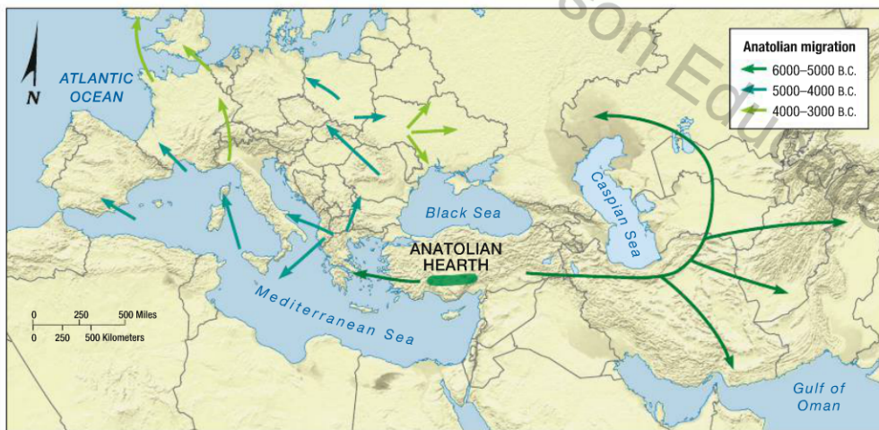
FIGURE 5-19 ORIGIN AND DIFFUSION OF INDO-EUROPEAN (SEDENTARY FARMER THEORY) Indo-European may have originated in present-day Turkey 2,000 years before the Kurgans. According to this theory, the language diffused along with agricultural innovations west into Europe and east into Asia.

south shores of the Black and Caspian seas by way of Iran and Pakistan, or indirectly by way of Russia north of the Black and Caspian seas.