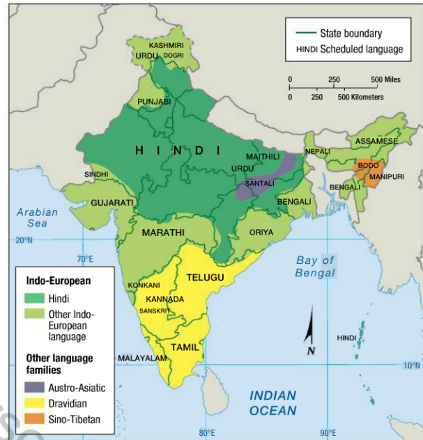
▲ FIGURE 5-11 LANGUAGE FAMILIES IN INDIA India's principal official language is Hindi, which has many dialects. The country has 22 scheduled languages that the government is required to protect.

India also recognizes 22 so-called scheduled languages, including 15 Indo-European (Assamese, Bengali, Dogri,