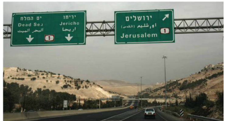
▼ FIGURE 5-34 HEBREW The road signs are in (top) Hebrew, (middle) Arabic, and English.

Can you think of other words that would not have existed in ancient times?