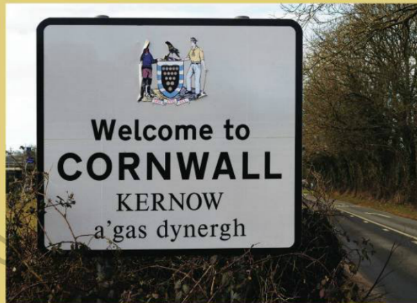
▲ FIGURE 5-40 CORNISH Sign for the town is in English and Cornish. The literal English translation of the Cornish version is “Cornwall welcomes you.”

In 1982, the European Union established the European Bureau for Lesser Used Languages (EBLUL), based in Dublin, Ireland, to provide financial support for the preservation of several dozen indigenous, regional, and minority languages spoken by 46 million Europeans. The Celtic languages received a lot of attention from EBLUL; for example, in 2002, EBLUL granted Cornish official status within the European Union (Figure 5-40).