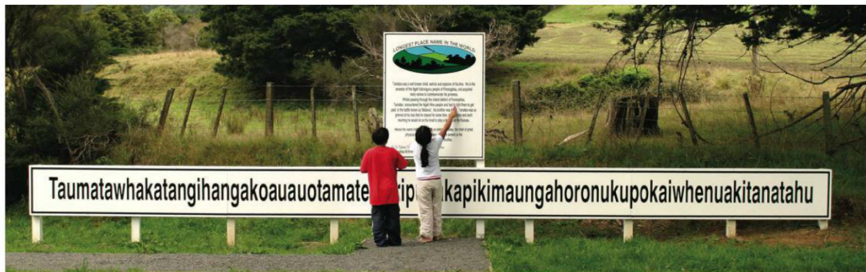
▲ FIGURE 5-39 MAORI LANGUAGE, NEW ZEALAND The sign, in Maori, is the name of this place, and is said to be the world's second-longest place name, at 85 letters. The Maori translates as “the summit where Tamatea, the man with the big knees, the climber of mountains, the land-swallower who travelled about, played his nose flute to his loved one.”

Occitan is spoken by about 2 million people in southern France and adjacent countries. The name derives from the French region of Aquitaine, which in French has a similar