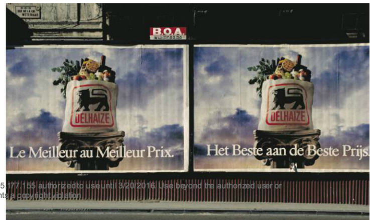
▼ FIGURE 5-28 LANGUAGE DIVERSITY IN BELGIUM Delhaize, a supermarket chain in Belgium, advertises on adjacent posters "the best at the best prices" (left) in French and (right) in Flemish.

In response to pressure from Flemish speakers, Belgium has been divided into two autonomous regions, Flanders and Wallonia. Each elects an assembly that controls cultural affairs, public health, road construction, and urban development in its region. But for many in Flanders, regional autonomy is not enough. They want to see Belgium divided into two independent countries. Were that to occur, Flanders would be one of Europe's richest countries and Wallonia one of the poorest.