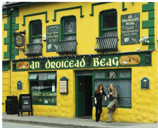
▼ FIGURE 5-36 IRISH The name of the pub means “the little bridge” in Irish.

In the 1300s, the Irish were forbidden to speak their own language in the presence of their English masters. By the nineteenth century, Irish children were required