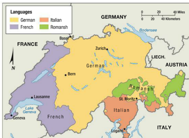
▲ FIGURE 5-29 LANGUAGE DIVERSITY IN SWITZERLAND The map shows Switzerland’s four official languages. The photo shows a sign that prevents hikers, vehicles, and horses from entering the forest because of timber cutting. German is top left, French top right, Italian lower left, and Romansh lower right. Switzerland lives peacefully with four official languages, including Romansh, which is used by only 1 percent of the population.

Groups living in different regions of Nigeria have often battled. The southern Igbos attempted to secede from Nigeria during the 1960s, and northerners have repeatedly claimed that the Yorubas discriminate against them. To reduce these regional tensions, the government has moved the capital from Lagos in the Yoruba-dominated southwest to Abuja in the center of Nigeria.