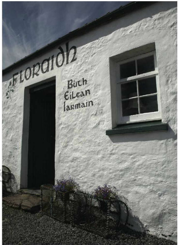
▲ FIGURE 5-38 SCOTTISH The sign over the door says that this is a florist. Eilean Iarmain is the Scottish name for the village of Isleornsay, Scotland.

A few hundred people have become fluent in the formerly extinct Cornish language, which was revived in the 1920s. Cornish is taught in grade schools and adult evening courses and is used in some church services. Some banks accept checks written in Cornish. See the Sustainability and Inequality in Our Global Village box for more on the revival of Cornish. After years of dispute over how to spell the revived language, various groups advocating for the revival of Cornish reached an agreement in 2008 on a standard written version of the language. Because the language became extinct, it is impossible to know precisely how to pronounce Cornish words.