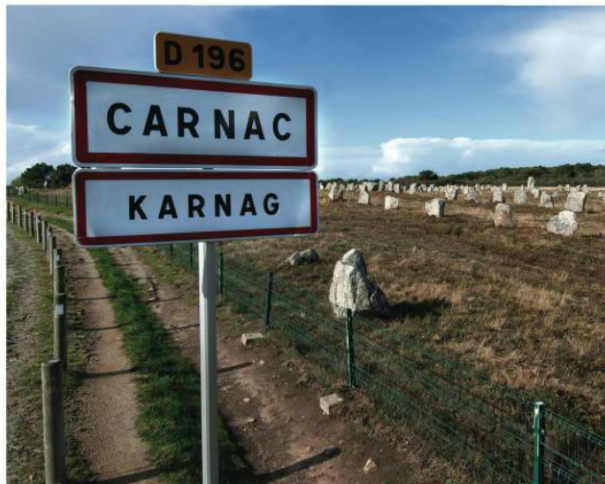
▼ FIGURE 5-37 BRETON Sign for the town is in French and Breton. In the background is the world’s largest collections of ancient stones, which were erected more than 5,000 years ago by people who inhabited Brittany before the Celts.

CORNISH. Cornish became extinct in 1777, with the death of the language’s last known native speaker, Dolly Pentreath, who lived in Mousehole (pronounced “muzzle”). Before Pentreath died, an English historian wrote down as much of her speech as possible so that future generations could study the Cornish language. One of her last utterances was later translated as “I will not speak English . . . you ugly, black toad!”