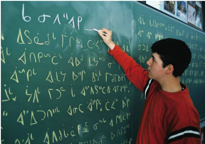
▼ FIGURE 5-33 ALGONQUIN Student in Chisasibi, Québec, writes in Cree, an Algonquian language.

The task of reviving Hebrew as a living language was formidable. Words had to be created for thousands of objects and inventions unknown in biblical times, such as telephones, cars, and electricity. The revival effort was initiated by Eliezer Ben-Yehuda, who lived in Palestine before the creation of the State of Israel and who refused to speak any language other than Hebrew. Ben-Yehuda is credited with the invention of 4,000 new Hebrew words—related when possible to ancient ones—and the creation of the first modern Hebrew dictionary.