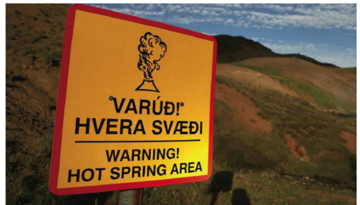
▲ FIGURE 5-32 ICELANDIC The warning sign in Icelandic and English is located in Hveragerdi, Iceland.

AN UNCHANGING LANGUAGE: ICELANDIC. Icelandic is related to other languages in the North Germanic group of the Germanic branch of the Indo-European family (Figure 5-32). Icelandic's significance is that over the past 1,000 years, it has changed less than any other language in the Germanic branch. As was the case with English, people in Iceland speak a Germanic language because their ancestors migrated to the island from the east, in this case from Norway. Norwegian settlers colonized Iceland in A.D. 874.