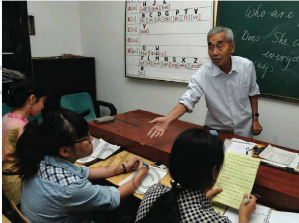
▲ FIGURE 5-43 TEACHING ENGLISH English is widely taught around the world, including this school in China.

German, French, or Russian. Students around the world want to learn in English because they believe it is the most effective way to work in the global economy and participate in the global culture.