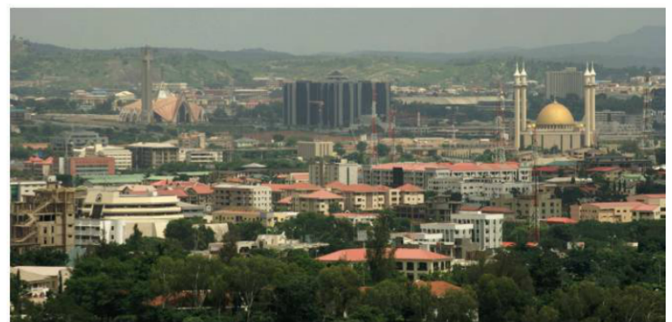
▲ FIGURE 5-30 LANGUAGE DIVERSITY IN NIGERIA The map shows Nigeria’s principal languages. The photo shows Nigeria’s capital city Abuja, which was built in the center of the country, where none of the three largest languages dominates. The city skyline includes a cathedral (left), national bank (center), and mosque (right).