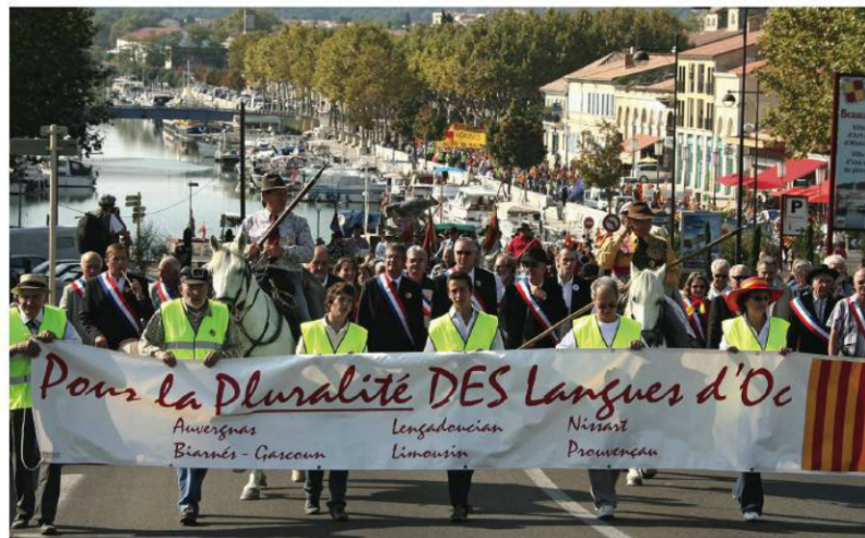
▲ FIGURE 5-41 PROVENCAL People demonstrate in Beaucaire, France, for the preservation of the Provençal language langue d'òc .

curriculum established by the national ministry of education. Still, many people living in southern France want to see more efforts by the government of France to encourage the use of Occitan (Figure 5-41).