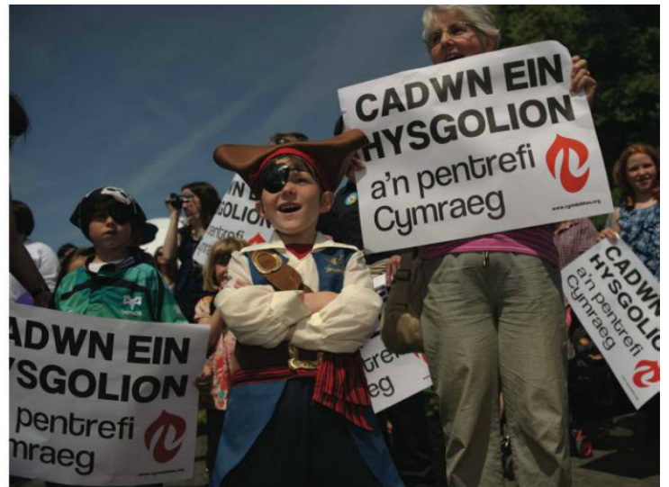
▲ FIGURE 5-35 WELSH Members of the Welsh Language Society protest closure of small rural schools; the signs say “save our Welsh-speaking village schools.”

Cymdeithas yr Iaith Gymraeg (Welsh Language Society) has been instrumental in preserving the language. Britain's 1988 Education Act made Welsh language training a compulsory subject in all schools in Wales, and Welsh history and music have been added to the curriculum. All local governments and utility companies are now obliged to provide services in Welsh. Welsh-language road signs have been posted throughout Wales, and the British Broadcasting Corporation (BBC) produces Welsh-language television and radio programs (Figure 5-35). Knowledge of Welsh is now required for many jobs, especially in public service, media, culture, and sports.