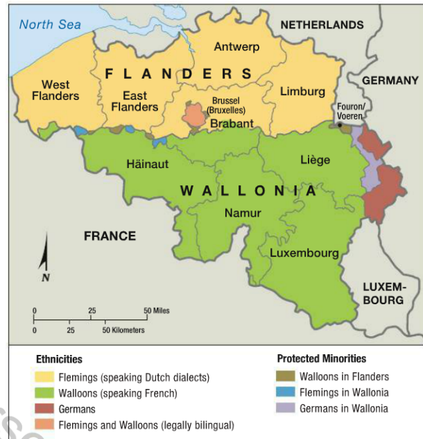
▲ FIGURE 5-27 LANGUAGES IN BELGIUM Flemings in the north speak Flemish, a Dutch dialect. Walloons in the south speak French. The two groups have had difficulty sharing national power.

Southern Belgians (known as Walloons) speak French, whereas northern Belgians (known as Flemings) speak Flemish, a dialect of the Germanic language Dutch (Figure 5-27). The language boundary sharply divides the country into two regions. Antagonism between the Flemings and Walloons is aggravated by economic and political