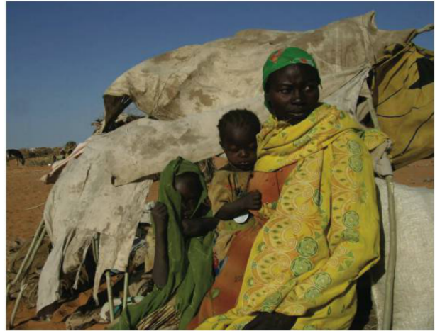
▲ FIGURE 7-45 DARFUR REFUGEE CAMP Refugees from Darfur are living in a camp in Adré, Chad.

Printed by School Educator (gene.francis@isd300.k12.mn.us) on 2/4/2015 from 205.215.177.155 authorized to use until 3/20/2016. Use beyond the authorized user or valid subscription date represents a copyright violation.