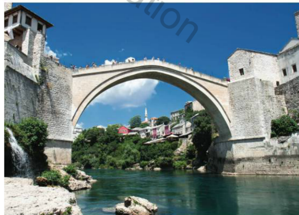
▲ FIGURE 7-42 ETHNIC CLEANSING IN BOSNIA & HERZEGOVINA

(top) The Stari Most (old bridge), built by the Turks in 1566 across the Neretva River, was an important symbol and tourist attraction in the city of Mostar. (middle) The bridge was blown up by Croats in 1993, in an attempt to demoralize Bosnian Muslims as part of ethnic cleansing (bottom). With the end of the war in Bosnia & Herzegovina, the bridge was rebuilt in 2004.