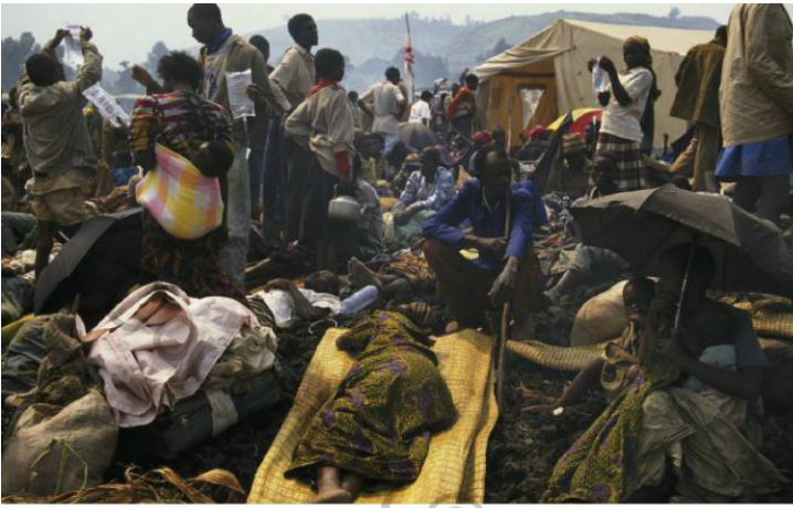
▲ FIGURE 7-49 ETHNIC CLEANSING IN RWANDA Hutu refugees in Congo.

in 1993, but after the assassination of the president in 1994, Hutus launched genocide against Tutsis, killing an estimated 800,000. The Hutu genocide ended after three months, with Tutsis gaining control of the country. Two million Hutu fled to neighboring countries in the ethnic cleansing that followed the Tutsi victory (Figure 7-49).