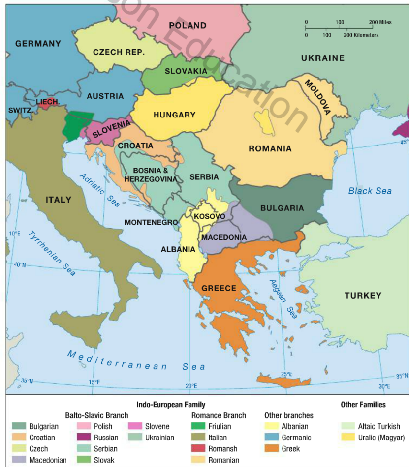
► FIGURE 7-38 LANGUAGES IN SOUTHERN AND EASTERN EUROPE After World War I, world leaders created several new states and realigned the boundaries of existing ones so that the boundaries of states matched language boundaries as closely as possible. These state boundaries proved to be relatively stable for much of the twentieth century. In the late twentieth century, the region became a center of conflict among speakers of different languages.

What is an example of another country that is inhabited primarily by people of Slavic ethnicity?