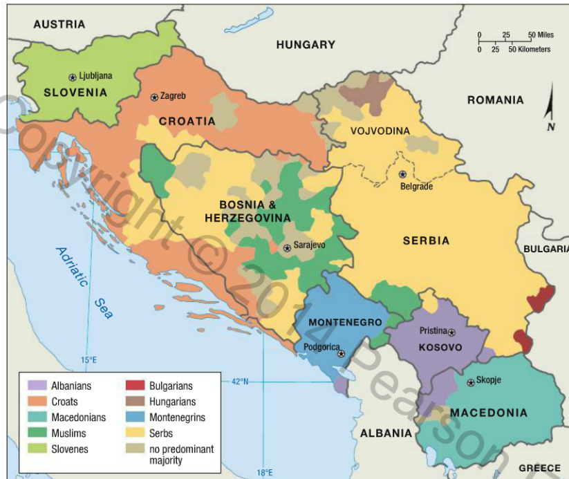
▲ FIGURE 7-39 YUGOSLAVIA UNTIL ITS BREAKUP IN 1992 Yugoslavia comprised six republics (plus Kosovo and Vojvodina, autonomous regions within the Republic of Serbia).