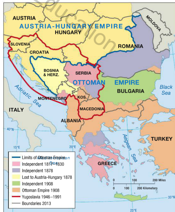
▲ FIGURE 7-40 THE BALKANS IN 1914

As long as Yugoslavia comprised one country, ethnic groups were not especially troubled by the division of the country into six republics. But when Yugoslavia's republics were transformed from local government units into five separate countries, ethnicities fought to redefine the boundaries. Not only did the boundaries of Yugoslavia's six republics fail to match the territory occupied by the five major nationalities, but the country contained other important ethnic groups that had not received official recognition as nationalities.