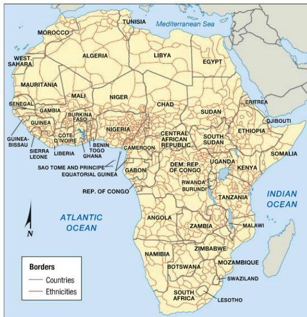
▲ FIGURE 7-50 AFRICA'S MANY ETHNICITIES The territory occupied by ethnic groups in Africa rarely matches the boundaries of countries.

Tutsis were instrumental in the successful overthrow of the Congo's longtime president, Joseph Mobutu, in 1997. Mobutu had amassed a several-billion-dollar personal fortune