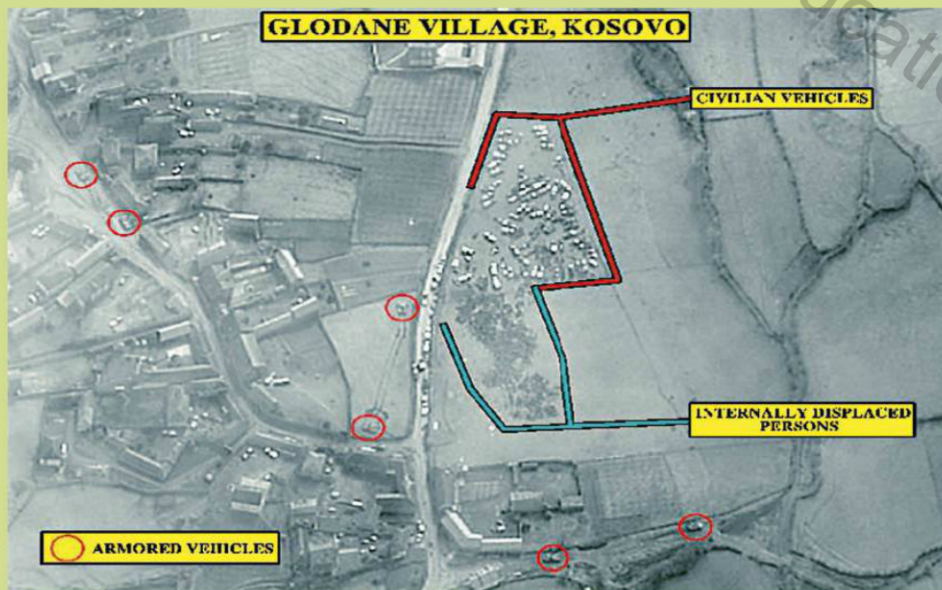
▲ FIGURE 7-41 EVIDENCE OF ETHNIC CLEANSING IN KOSOVO Ethnic cleansing by Serbs forced Albanians living in Kosovo to flee in 1999. The village of Glodane is on the west (left) side of the road. The villagers and their vehicles have been rounded up and placed in the field east of the road. The red circles show the locations of Serb armored vehicles.

Aerial photographs such as these not only “proved” that ethnic cleansing was occurring but also provided critical evidence to prosecute Serb leaders for war crimes.