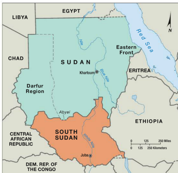
▲ FIGURE 7-44 SUDAN AND SOUTH SUDAN South Sudan became an independent country in 2011.

Printed by School Educator (gene.francis@isd300.k12.mn.us) on 2/4/2015 from 205.215.177.155 authorized to use until 3/20/2016. Use beyond the authorized user or valid subscription date represents a copyright violation.