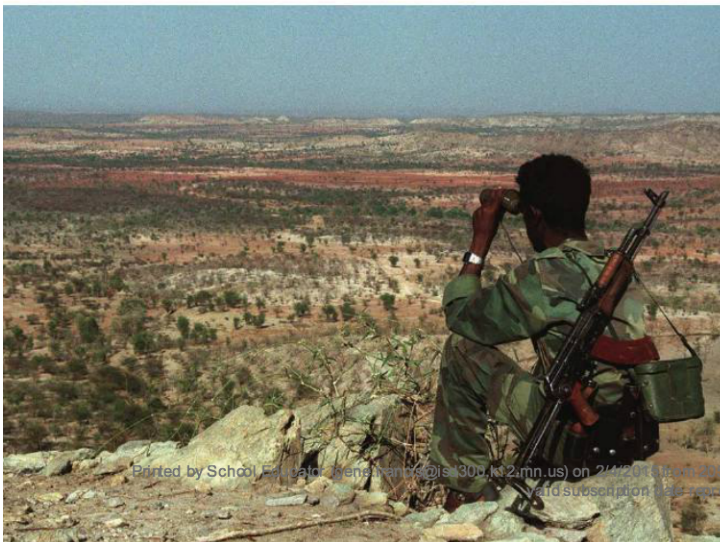
▼ FIGURE 7-47 ERITREA–ETHIOPIA BORDER The border between Eritrea (background) and Ethiopia (foreground) is unmarked here.

A country of 5 million people split evenly between Christian and Muslim, Eritrea has two principal ethnic groups: Tigrinya and Tigre. At least in the first years of independence, a strong sense of national identity united Eritrea's ethnicities as a result of shared experiences during the 30-year war to break free of Ethiopia.