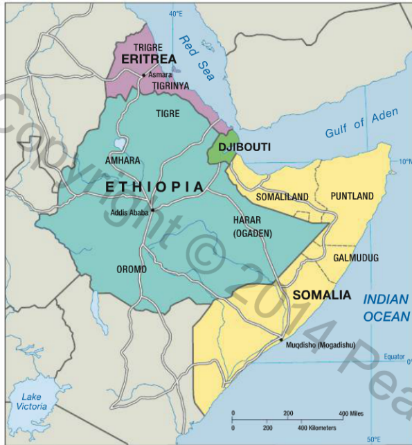
▲ FIGURE 7-46 HORN OF AFRICA Eritrea broke away from Ethiopia to become an independent country in the early 1990s. Somalia is divided into several territories controlled by various ethnic groups.

Eritrean rebels defeated the Ethiopian army in 1991, and 2 years later Eritrea became an independent state. But war between Ethiopia and Eritrea flared up again in 1998 because of disputes over the location of the border. Eritrea justified its claim through a 1900 treaty between Ethiopia and Italy, which then controlled Eritrea, but Ethiopia cited a 1902 treaty with Italy. Ethiopia defeated Eritrea in 2000 and took possession of the disputed areas. Battles along the border have continued (Figure 7-47).