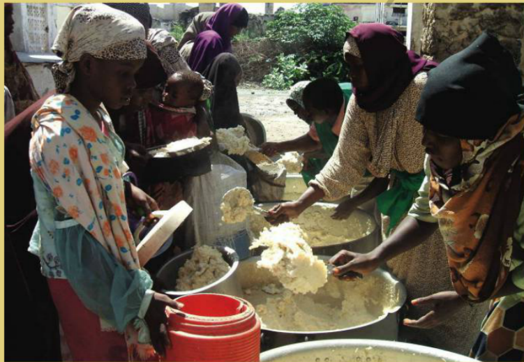
▲ FIGURE 7-48 SOMALIA Somali victims of fighting and famine line up for food and medical assistance in 2011.

Adding to the woes of the Somali people, the worst drought in 60 years hit the country in 2010 and 2011, especially in the south (Figure 7-48). It is impossible to count the number of Somalis forced to migrate because of famine rather than civil war; both factors probably affect most Somalis. Because of the civil war, much of the food and water sent by international relief organizations could not get through to the people in need. Improved weather in 2012 resulted in a larger harvest, and more supplies were reaching people.